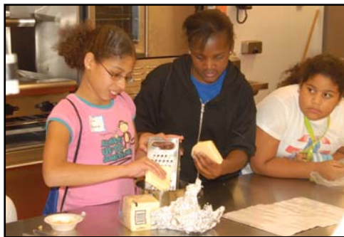
New Balance Healthy Living Club members prepare special healthy snacks