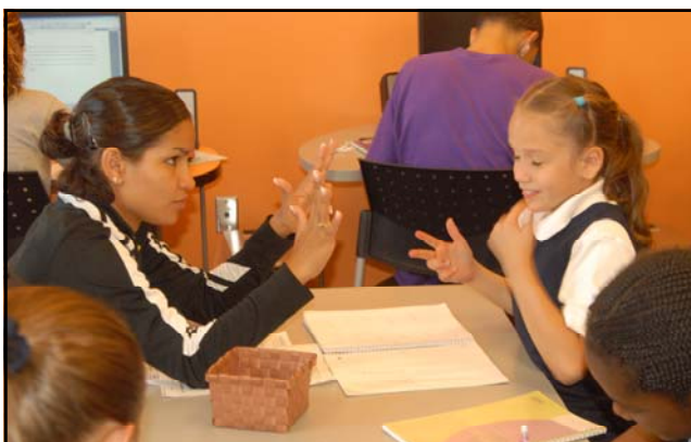
Our Learning Center was host to about 200 members a day and over 300 volunteers last year