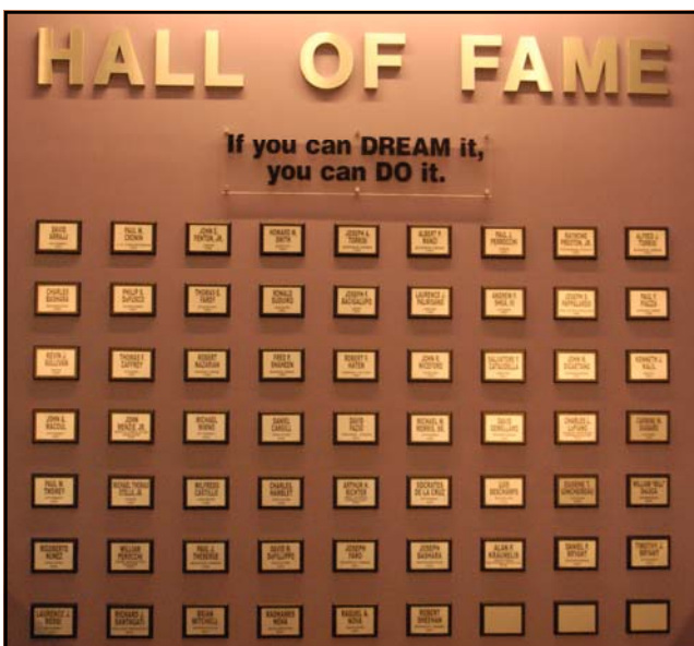
Our Hall of Fame Board was dedicated on November 15, 2007