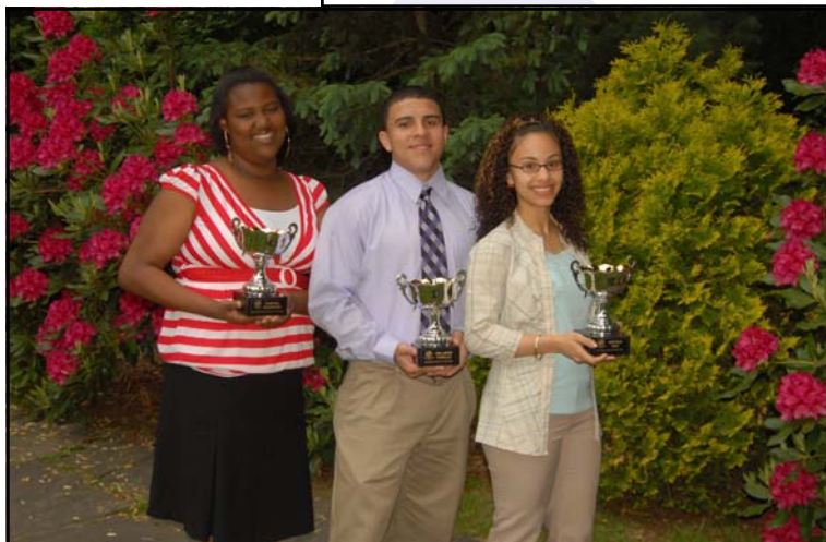
Our Youths of the Year