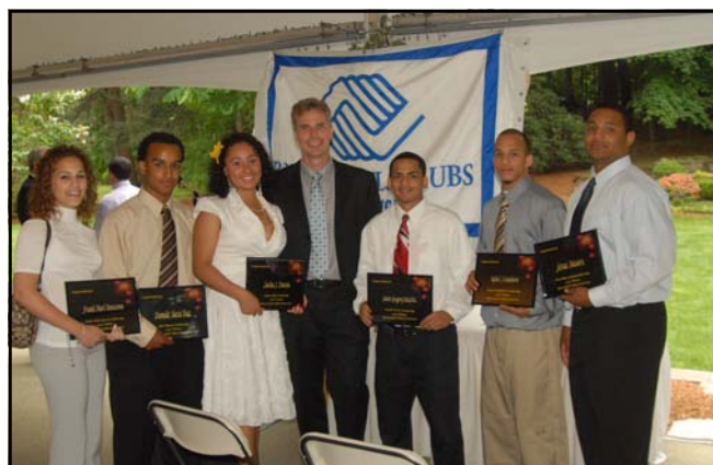
Scholarship winners - 2007