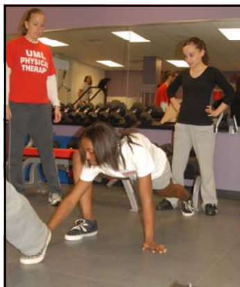
U-Mass Lowell students teach fitness techniques