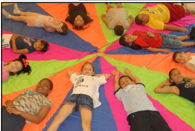
Kids Against Violence Day in June drew over 450 members and numerous law enforcement officials