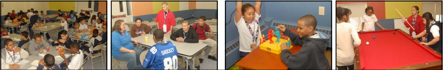
Scenes from the Grand Re-opening of the Beacon BGC

BGCL capital improvements did not stop with the completion of our Water Street facility. Another generous grant from the Amelia Peabody Foundation enabled us to undertake a major renovation of our Beacon Clubhouse in collaboration with the Lawrence Housing Authority. With additional space made possible by a vacating preschool program, the Beacon, a satellite Club located in the Beacon Courts public-housing project, was expanded and transformed to meet growing member needs. Now a modern, delightfully appointed facility, it is a source of pride to our kids, their families, our staff and the entire Lawrence community.