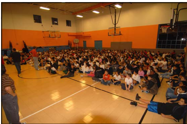
All Club meetings solve problems