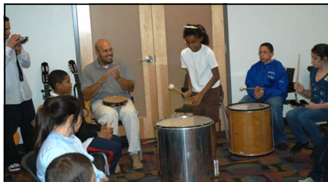
Drums, guitar & keyboard recital