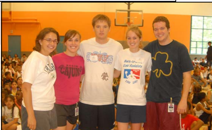
Last summer, five University of Notre Dame students worked on an internship at the Club .